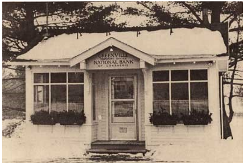
Early bank, 1960s, later Mary's Restaurant, today site of Cumberland parking lot

We finished with a couple pictures of the pond being dredged, as it should be done every 10 to 20 years, and some you suggested that it's been long overdue now. We showed a couple signs that used to be on the corner. One was the World War II Honor Roll (1995 calendar). Another one was a listing of area