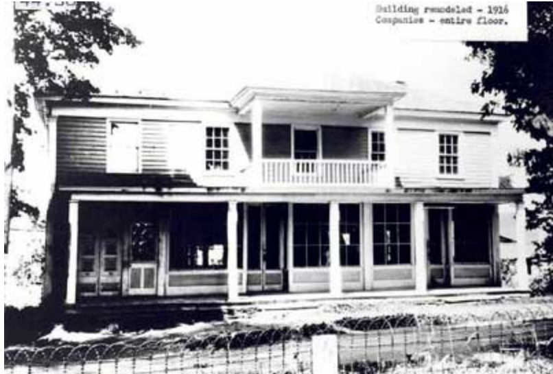
Hart's Store, later shared with Pioneer Insurance; Located in today's parking lot of Town Offices

We did not include any photos of Matt's hot dog stand. Just across the pond entrance sat Wessel's Garage. That building was shown in many photographs. When it was torn down it made way for a building that many of us remembered as Flach's Barbershop, which then transitioned to Mangold's Realty. A new business, Lola, just established itself there this year.