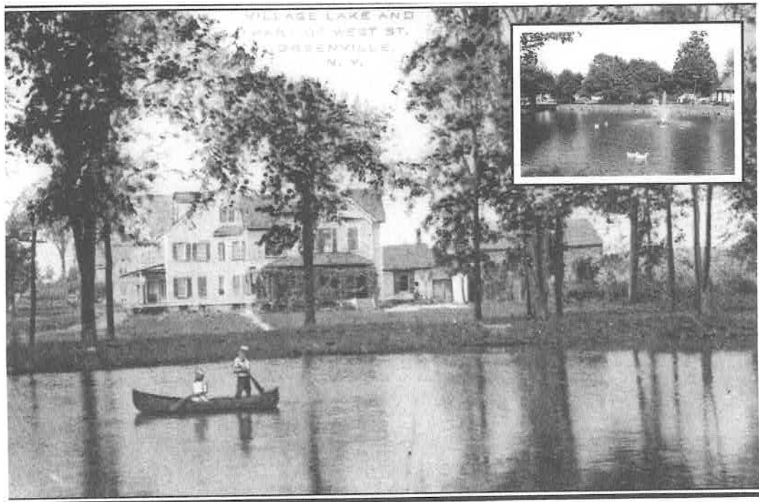
Below: Rowing the length of Greenville Pond Background - Elsie Roe's House, Cunningham's