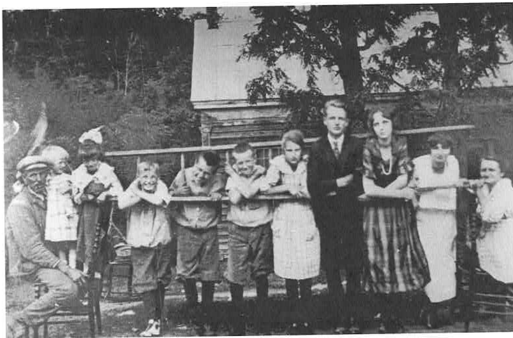
Above: The Griffin family in a classic pose, at home on Red Mill Rd House in background next to Red Mill and saw mill