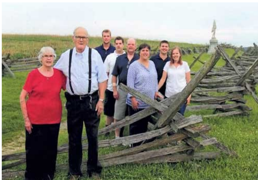
Generations 1, 2 and 3—2018 photo, at Gettysburgh