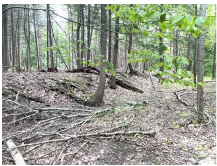
Site of mill, and original marker

One other geographic detail of note is associated with this site. It is one of the rare places on the Basic