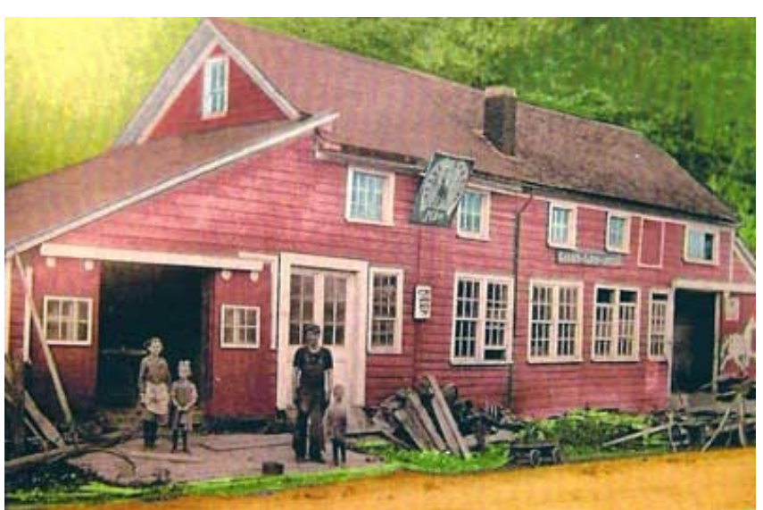
#1: Blacksmith Shop