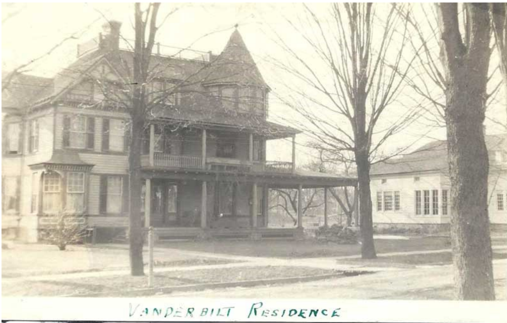
South Street, current Greenville Arms; Hegemon house on right (today's Ciani & Morris) (from the Curt Cunningham collection)