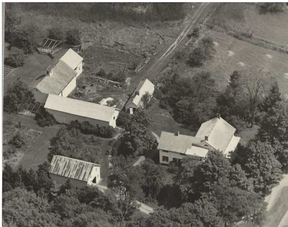
Aerial view of Stevens' farm on Route 26