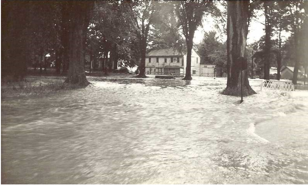
High waters overflowing Greenville pond; view from pond's outlet. Wessel's Garage in upper center, today site of Mangold Realty (before that the Flach barbershop)