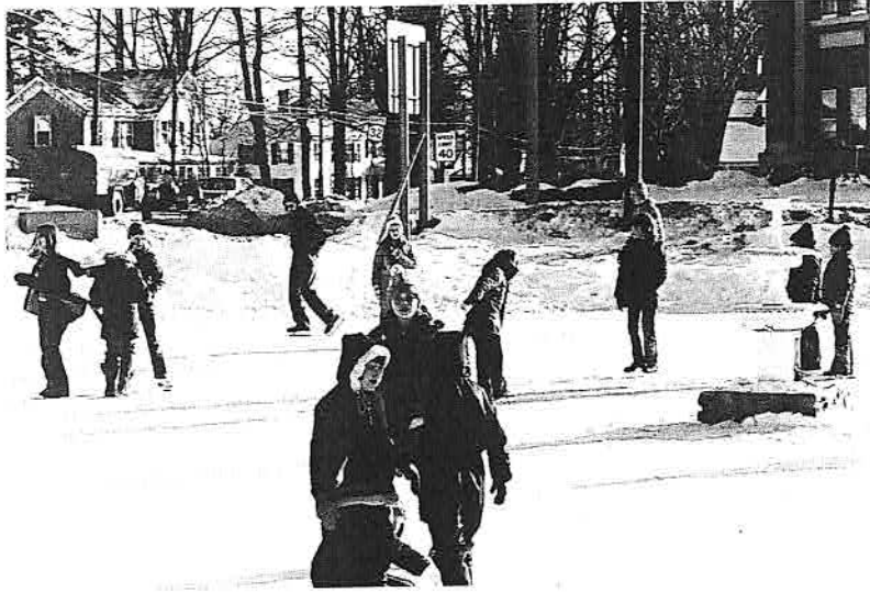
Ice skating on the Greenville Pond (When was the photo taken? And do you have a detail or two that could be added to a caption?)