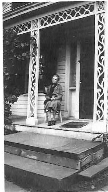
Same house as shown in photo to left?

The glue loosened, the photo came loose, and I could read the back: