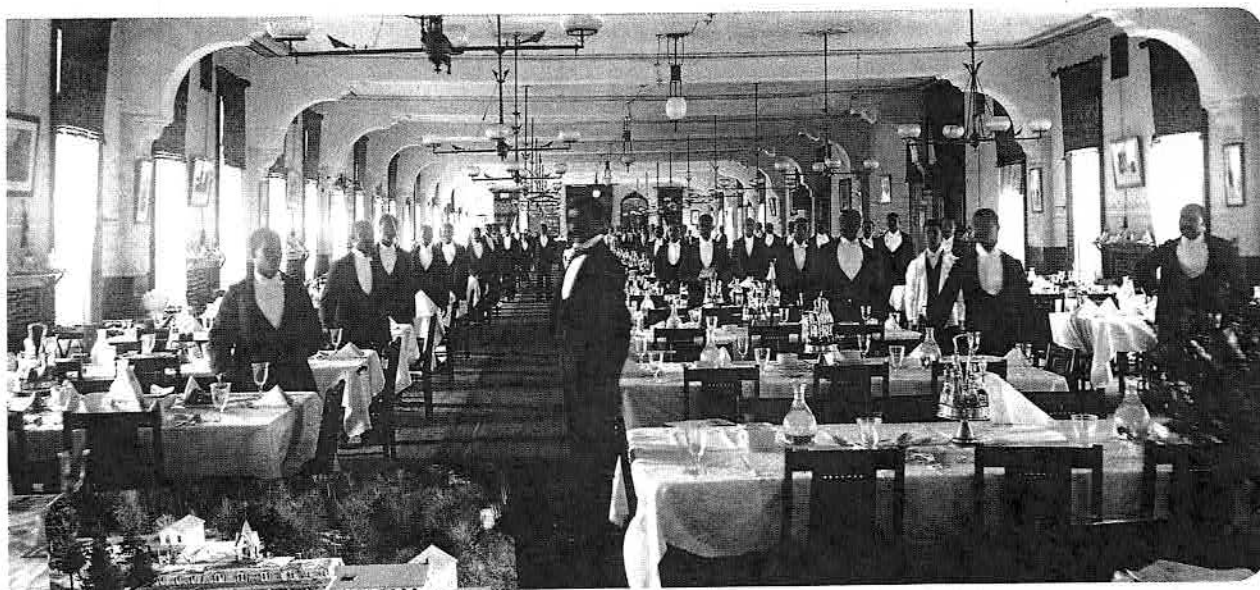
Fit for a king The Hotel Kaaterskill's expansive dining hall held nearly 1,000 guests; an aerial view of the Laurel House (inset) displays the 1881 expansion and impressive falls before it; below, the original Hotel Kaaterskill façade before the 1883 annex was added